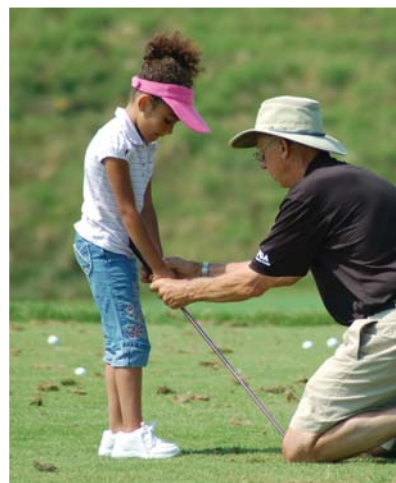
There's nothing more important than a proper grip!

In TFTCT's Group Lessons program, which were conducted in the spring, summer and fall, children received golf instruction in classes with no more than an eight-to-one student/instructor ratio. The lessons were taught by PGA professionals or other qualified instructors at over 15 different golf courses and facilities throughout the state. The classes met once/week for five to seven weeks, during which time the participants were taught the fundamentals, rules and etiquette of golf along with a curriculum of life skills. Children were