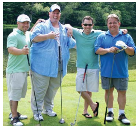
Final, Final participants enjoy the day at Glastonbury Hills CC