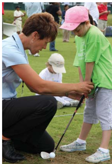
Women's Day, sponsored, in part, by the ING New England Golf Classic.