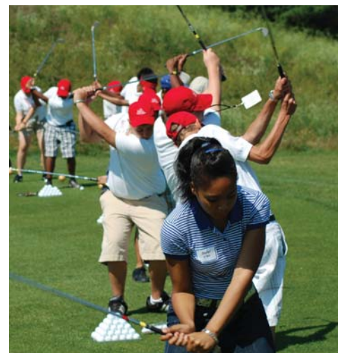
Members of the Hartford Team warm up prior to a match

able to advance levels according to TFTCT guidelines (Par, Birdie, Eagle). In order to advance a level, each participant was required to pass both written and demonstration tests covering golf, etiquette and life skills. In 2009, the Group Lessons program was conducted in several cities including Danbury, Stamford, Norwalk, Bridgeport, Stratford, Waterbury, Prospect, Hartford, New Haven, Madison, East Granby, Cromwell and