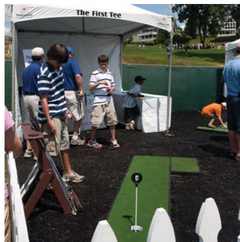
The Flomax Putting Challenge at the Travelers Championship