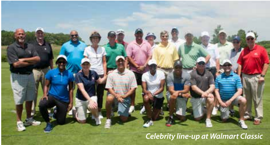
Celebrity line-up at Walmart Classic

Central Connecticut Charity Classic has raised close to $818,000 in support of programming in the central part of the state. This day would not be possible without all of our sponsors, with special emphasis on our top tier sponsors including: our Title Sponsor, Walmart and our Presenting Sponsor, Stanley Black & Decker.