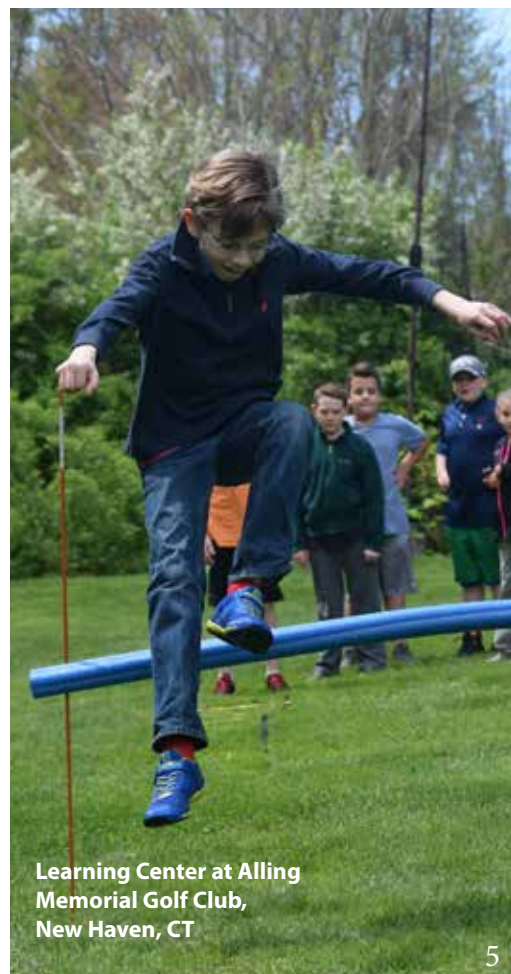
Learning Center at Alling Memorial Golf Club, New Haven, CT