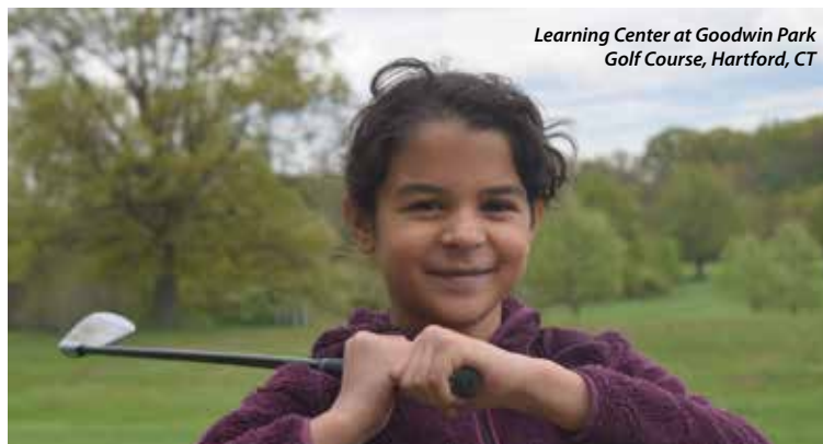
Learning Center at Goodwin Park Golf Course, Hartford, CT

incorporating important Life Skills within golf activities. The Life Skills Experience is at the heart of what The First Tee is all about. Our trained coaches teach young people aged 5-18 Nine Core Values: Honesty, Integrity, Respect, Courtesy, Judgment, Perseverance, Sportsmanship, Confidence and Responsibility , and Nine Healthy Habits like staying hydrated or being part of a community. Speaking of a community, we enjoyed another exciting Summer Camp season with over 200 young people attending one of our eight, four-day camps that included Girls Only sessions and half day sessions for our 5 and 6 year old friends. The Life Skills Experience would not be as effective (and at the same time fun) as it is without our fine