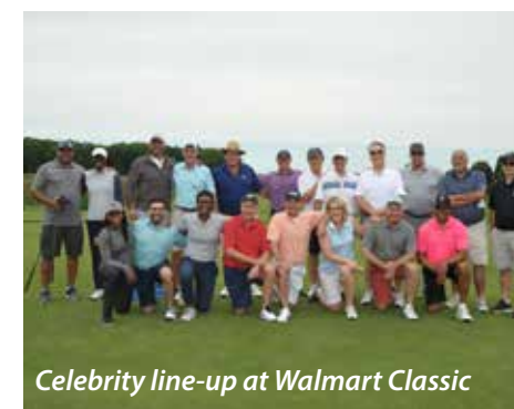
Celebrity line-up at Walmart Classic