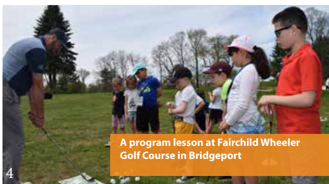
A program lesson at Fairchild Wheeler Golf Course in Bridgeport